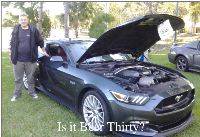
Is it Beer Thirty?