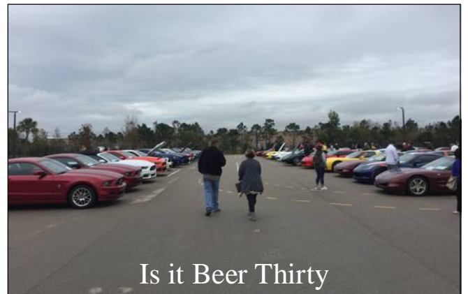
Is it Beer Thirty