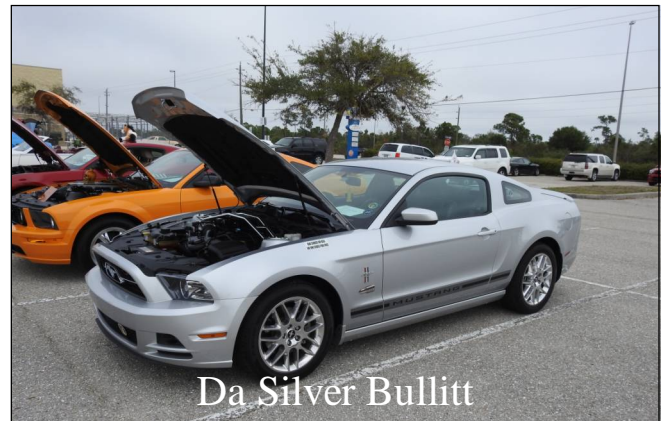
Da Silver Bullitt