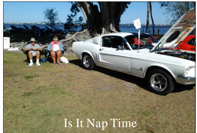
Is It Nap Time