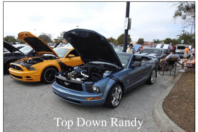
Top Down Randy