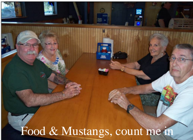
Food & Mustangs, count me in