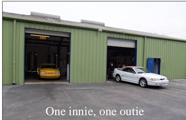
One innie, one outie