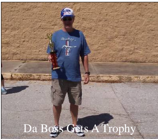
Da Boss Gets A Trophy