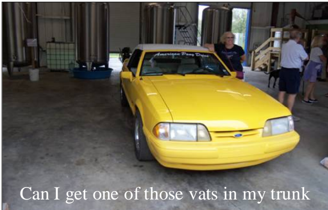
Can I get one of those vats in my trunk