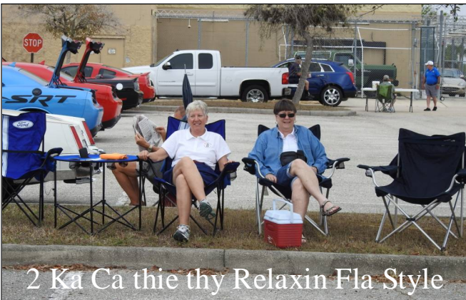
2 Ka Ca thie thy Relaxin Fla Style