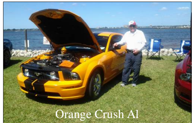
Orange Crush Al