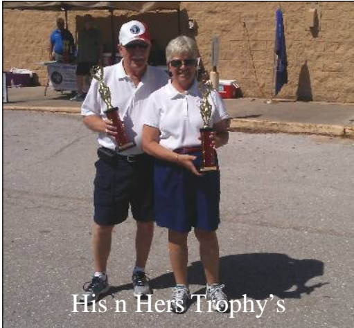
His n Hers Trophy's