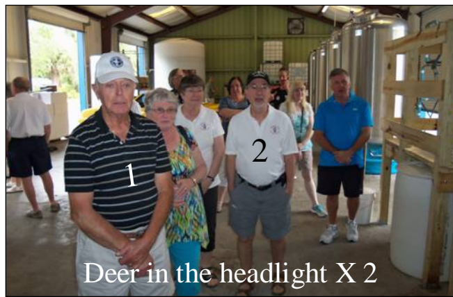
Deer in the headlight X 2