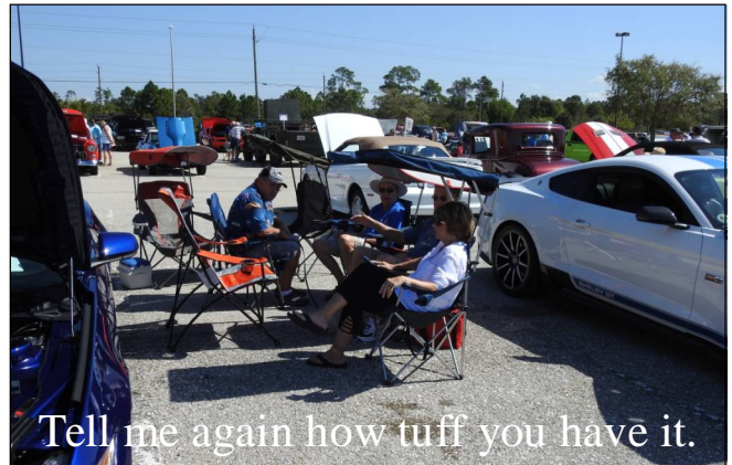
Tell me again how tuff you have it.