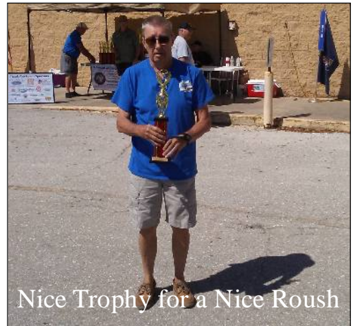
Nice Trophy for a Nice Roush