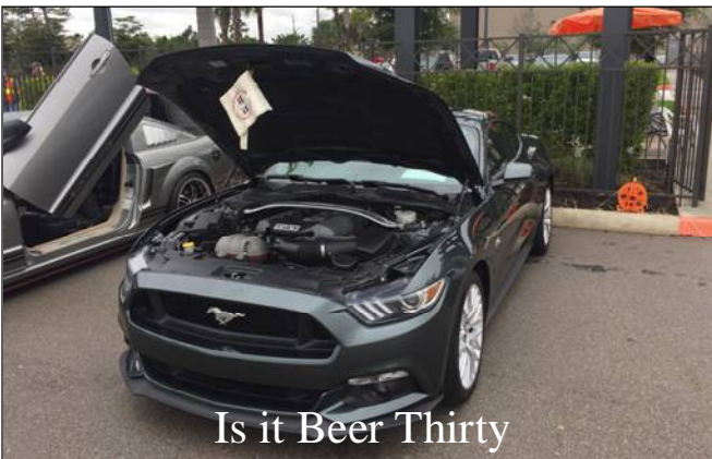
Is it Beer Thirty