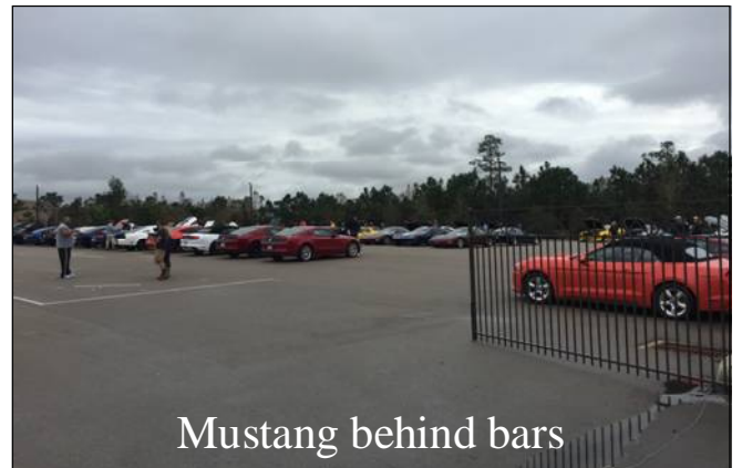
Mustang behind bars