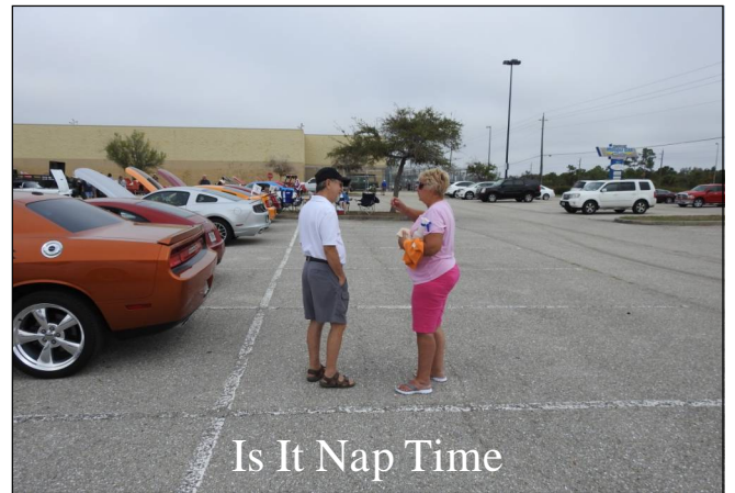
Is It Nap Time