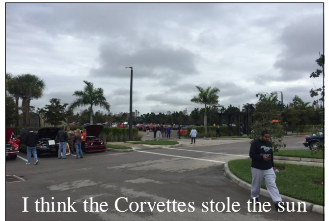
I think the Corvettes stole the sun