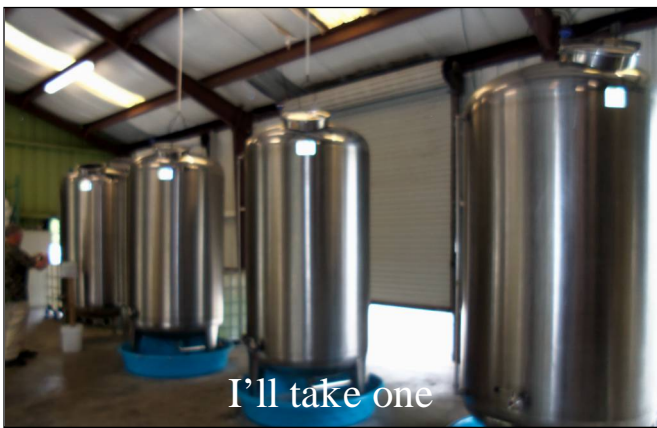
I'll take one